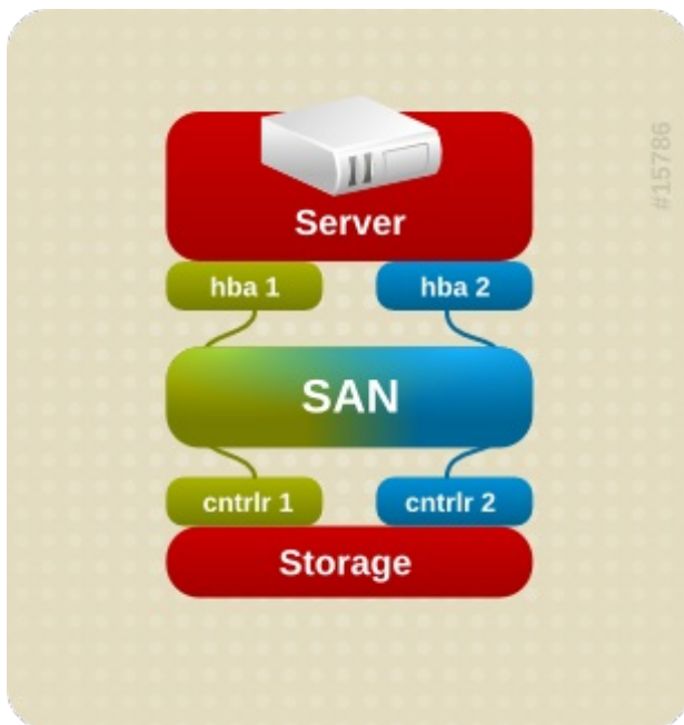
Figure 1.3. Active/Active Multipath Configuration with One RAID Device